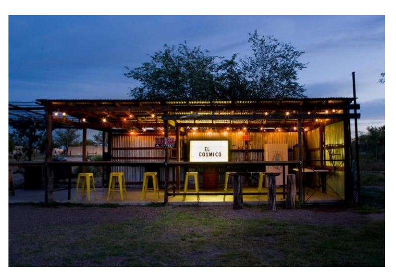
El Comisco Kitchen in Marfa, Texas

Create a unique activity center(s) along the Rockbridge Road corridor that can serve as a location for a variety of programming including outdoor music, farmers markets, pop-up shops, food trucks etc. - To attract both local residents and visitors from outside of the community, this activity center should be original and unique, representing not only an appreciation for the arts and environment, but also boldly celebrating the existing gritty, automobile-centric environment along Rockbridge Road.