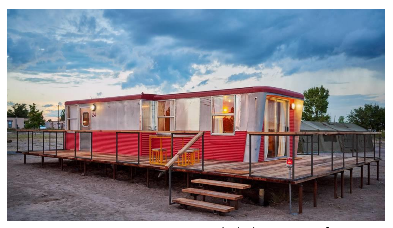
Overnight lodging in Marfa, Texas

A potential site for this activity center could be the front of the vacant 13-acre tract near the intersection of Allgood and Rockbridge Roads. Alternatively, a variety of uses could be split up in different locations along the corridor.